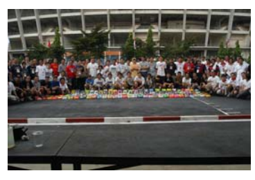
2004 Futaba Jakarta Open