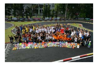
2007 FEMCA Championships