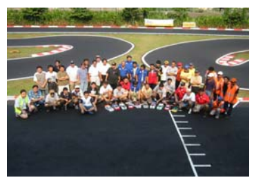
2002 Futaba Jakarta Open