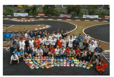
2003 Futaba Jakarta Open

will enter the left hand set of esses. Again, after the racers passes the esses with a medium-full-throttle, they will enter a left hand set of esses until they hit a slow right